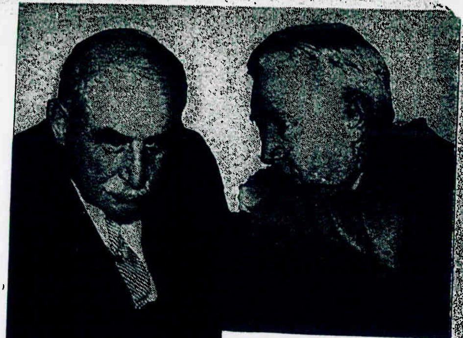
JOHN W. DAVIS Chief Morgan lawyer, shown to be tied up with fascist organizations