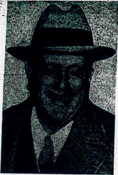
WILLIAM RANDOLPH HEARST Red-hunter-in-chief, boss of the American Legion, who nurses the fascist plot

many more millions available if necessary, is now on a campaign to get 4,000,000 members—a powerful band if properly financed by the country's leading financiers.