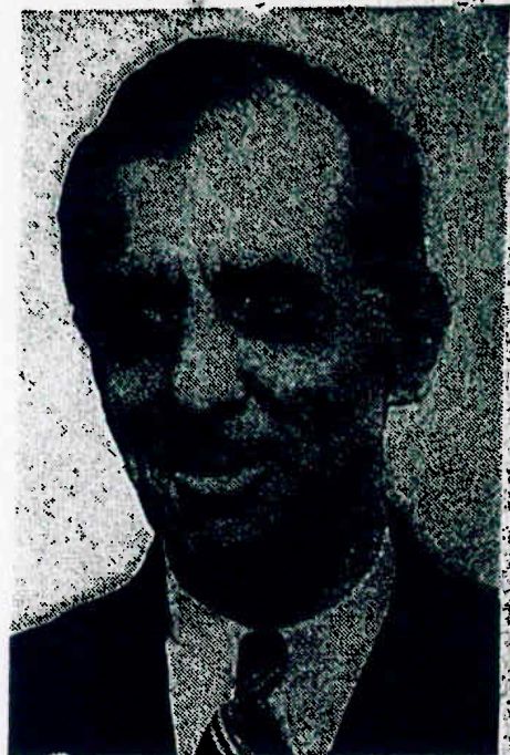
GEN. SMEDLEY D. BUTLER Who turned down this particular offer of a ride on a white horse

On July 27, 1934, he deposited $39,106.78. On July 27, 1934 (the same day) he again deposited $97,766.94.