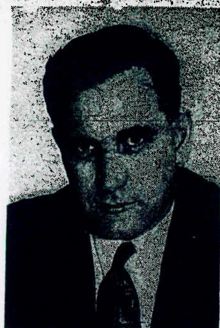
JOHN W. McCORMACK